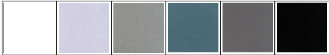
White Silver Cloud PMS# 5315u Gray PMS# 423c Graphite PMS# 5473u Charcoal PMS# Cool Grey 11c Black