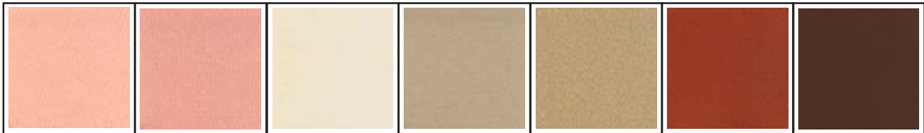
Peach PMS# 162u Carnation PMS# 487c Bone PMS# 7506u Beige PMS# 7502u Sable PMS# 466u Terra Cotta PMS# 174c Brown PMS# 476c