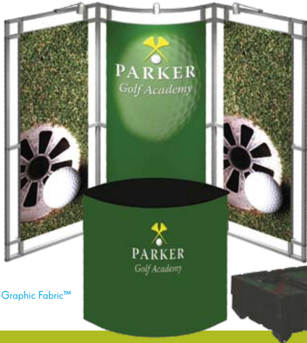
3 Panel Graphic Fabric™